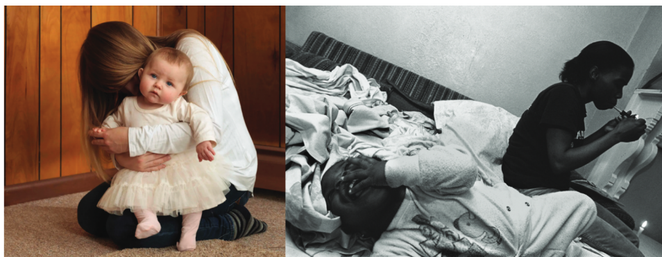
Figure 1. Media coverage of white mothers who use opioids (29) versus Black mothers who use crack cocaine (31).

Despite crack cocaine being portrayed as having strong addictive properties (37,38), the potency and psychoactive effects of crack cocaine were found to be similar to those of powder cocaine. Similar to the current position held by the National Institute on Drug Abuse (39), Hatsukami and Fischman (40) concluded that individuals who have a cocaine use disorder and “who are incarcerated for the sale or possession of cocaine are better served by treatment than prison” (40). Indeed, a series of U.S. Sentencing Commission reports renounced stereotypes perpetuated by the media-induced scare by stating that no studies have shown crack cocaine to render people more prone to committing violent crimes compared to powder cocaine (14,41–43).