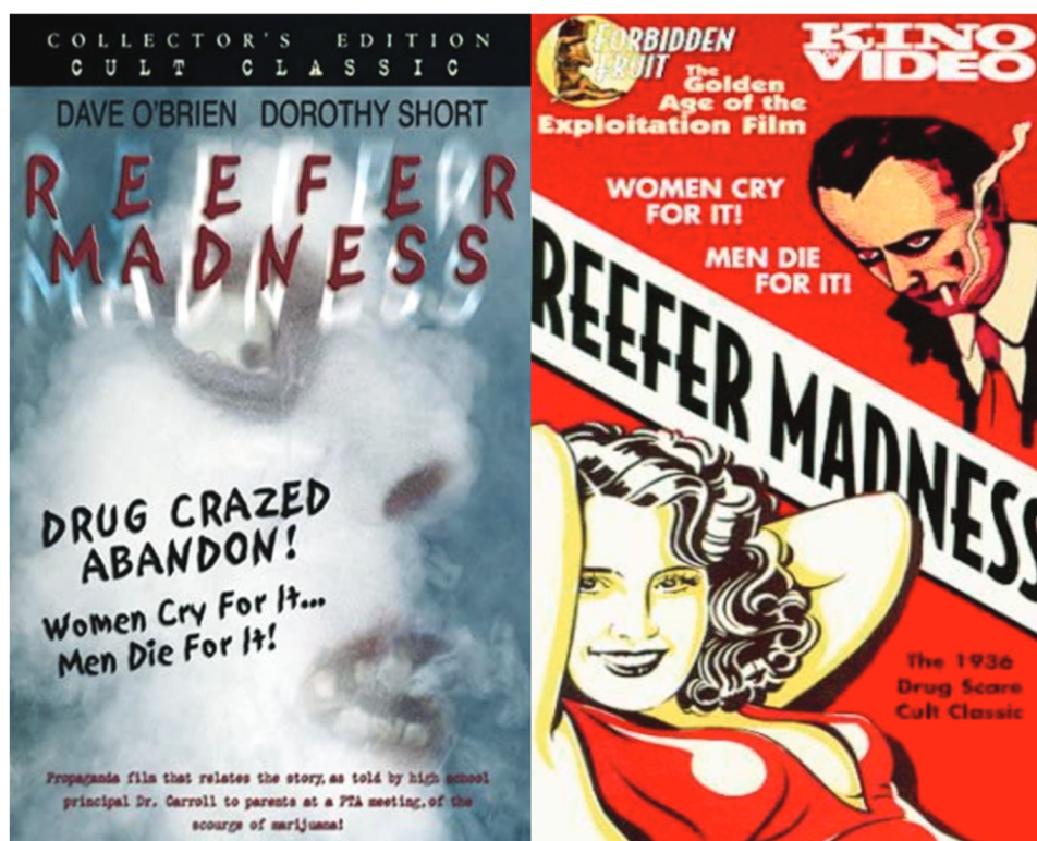
Figure 3. Imagery associated with cannabis use in the 1936 film Reefer Madness (67).

with zombie imagery (52). Frankenstein imagery was particularly potent based on the idea of scientific experimentation creating monsters rather than improving humanity (52). Empirical studies later evaluated people who use ecstasy negatively, arguing that ecstasy use is linked to crime and breaks down people's high self-control to induce aggressiveness (76,77). Stories about monsters using drugs who go berserk and commit extreme acts of violence faced little challenge due to the "near-total chemical illiteracy of legislators and media personnel" (52).